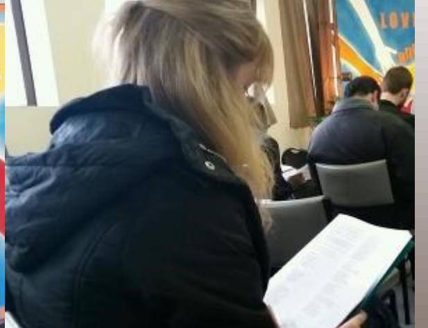
Life and Love Youth retreat