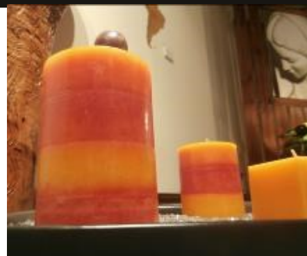
Prayer for Peace