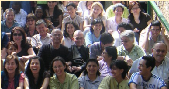
The Verbum Dei Family around the world together with our founder.

The Verbum Dei family received its first official recognition as a Pious Union on January 17, 1963 and on April 15, 2000 was given the status of Pontifical Right by Pope John Paul II.