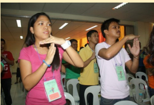
Participants doing the steps for the animation song.

The objective of our apostolate is to forge a Christian discipleship that fully integrates every aspect of a person's life. By nurturing a Christian spirituality, we strive that each individual can authentically