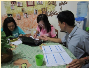
Disciples preparing for a one-day encounter with students.

Our retreat or weekend encounters hope to introduce or renew in the participants their experience of God and the Catholic Christian community. This includes guided meditation with Scripture, participation in the sacraments, small group faith sharing, team and faith building activities, moments of relaxing, ice-breakers and games.