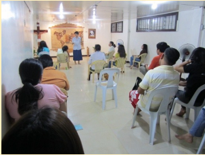
A missionary preaching in a School of the Word

Our apostolate centers located around the city are open for anyone who would like to have a moment of prayer and reflection with the Word of God.